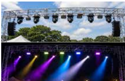
Event Production and Technical Solutions