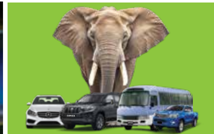
Tours, Travel & Car rental services