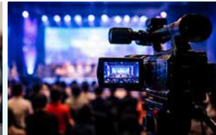
Media Production and Live Coverage Solutions