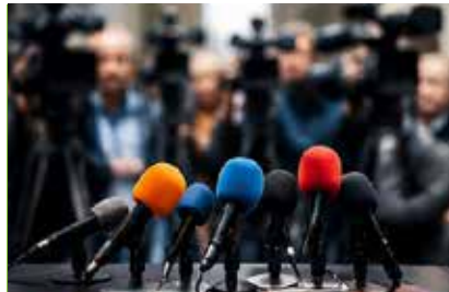
Media and Communication Solutions