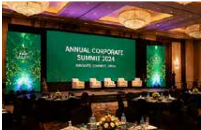
Event Management Solutions

Our services are organized into specialized solution categories to ensure efficient planning, execution, and professional delivery.