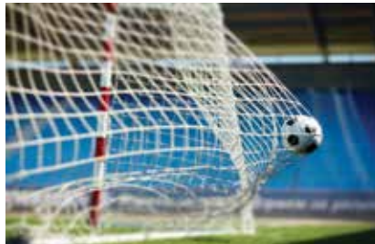
Sports Activation & Fan Engagement Solutions